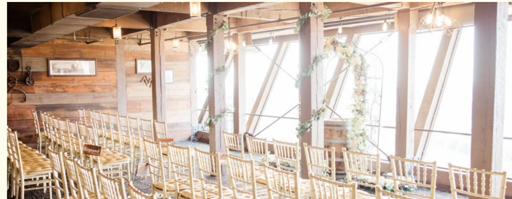
The ceremony rooms in Silverado & Angel's Camp offer panoramic views of Orange County.